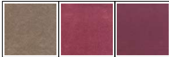
Taupe PMS# 7505u