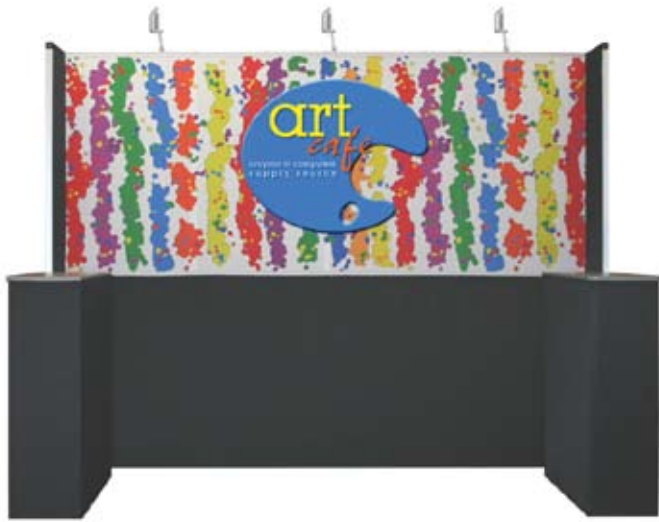
Horizontal Graphic Fabric™