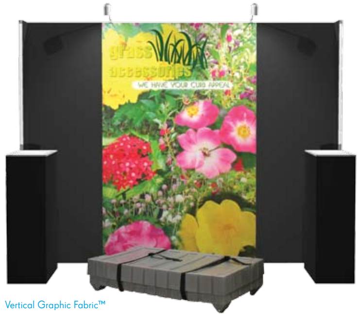
Vertical Graphic Fabric™