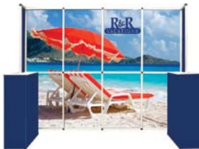
rear mounted Lexan® Digital Graphic